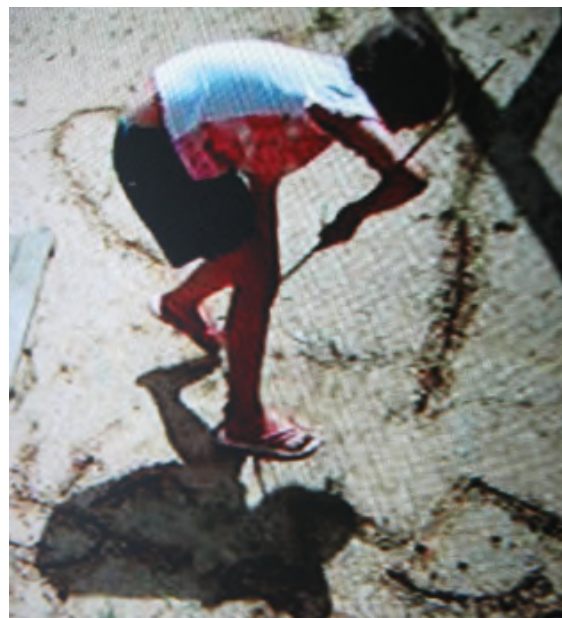
My Lord is a child, this I know (print)